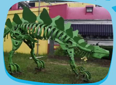
Stegosaurus by Jim Gary

When it comes to trash, maybe it's just imagination that helps turn it into someone else's treasure!